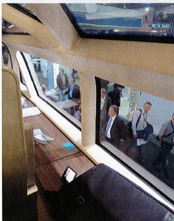
Sideboard: a luggage shelf makes use of available space alongside the double seats on the Aeroliner top deck.